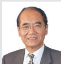
Mr Koïchiro Matsuura, Director-General, UNESCO

This MOU sets out for the first time a legal basis and an explicit instruction for UN Resident Coordinators/Resident Representatives to invite National Commissions to participate in the activities of the United Nations Country Team (UNCT). This represents a real breakthrough, as no other UN agency has so far reached this kind of "understanding" with UNDP. Article III.2 of the MOU stipulates that "The Resident Coordinator (RR)/Resident representative (RC) may invite a UNESCO national commission member(s) to attend certain UNCT meetings,