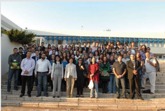
Workshops on Lebanese youth cultural reconciliation

The "Lebanese youth reconciliation" project, is being organized in collaboration with the Ministry of Education, the Ministry of Culture and the Arab Organization for Education, Culture and Sciences (ALECSO). A series of workshops will be held in different regions in Lebanon. The project, which plans to target a total of 1,000 university students, aims at raising youth awareness, on concepts of citizenship, diversity, acceptance of the other; equipping them with skills of dialogue, interpersonal conflict resolution, teamwork and community services. So far, three workshops have been held in Beirut, North Lebanon and in Mount Lebanon. The workshops covered cultural aspects of religion; citizenship in terms of rights and roles; teamwork and community service; conflict resolution and negotiation models; building bridges with the other and enhancing synergy and cooperation.