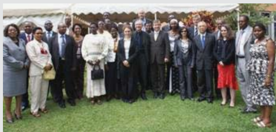
Kigali, Rwanda Workshop

National Commissions from five East African countries, namely Burundi, Kenya, Rwanda, Uganda, and the United Republic of Tanzania, participated in this first workshop. It focused on the status, strategy and functioning of National Commissions, UNESCO's strategic planning and UN common country programming, results based management (RBM) of projects and programmes, education for sustainable development (ESD) in the context of the World Conference on Education for Sustainable Development (Bonn, Germany, 31 March – 2 April 2009) and the Programme of Man and the Biosphere (MAB). As a result of this training, a joint project proposal was made by the five participating National Commissions, with a view to further enhancing their capacities and networking.