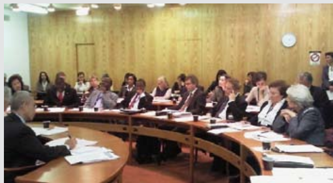
Informal meeting of National Commissions at the 181 st Executive Board

Intellectual debates, strategic thinking and substantive discussions would be needed for the Consultations to be more effective. The "world café" approach tested at the