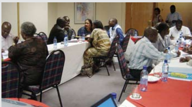
Group discussions in Maseru

The second workshop, opened by Dr. Mamphono Khaketla, Minister of Education and Training and President of the Lesotho National Commission for UNESCO, was attended by the Secretaries-General of seven Southern African National Commissions (Botswana, South Africa, Malawi, Zambia, Zimbabwe, Namibia and Lesotho). The agenda included National Commissions' structure and functioning, strategic planning and project implementation, the "One UN" process and role of National Commissions, education