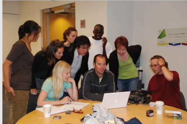
World Heritage Youth Forum – Québec, July 2008

Thirty young people from the five geographic regions of UNESCO participated in the World Heritage Youth Forum in July 2008 in Québec City, coinciding with the city's 400 th anniversary celebration, intensively learning about the World Heritage Convention and attending sessions of the World Heritage Committee.