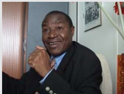
Secretary-General of the Uganda National Commission

Q: What do you think about the impact of the “One UN” reform at country level on National Commissions?