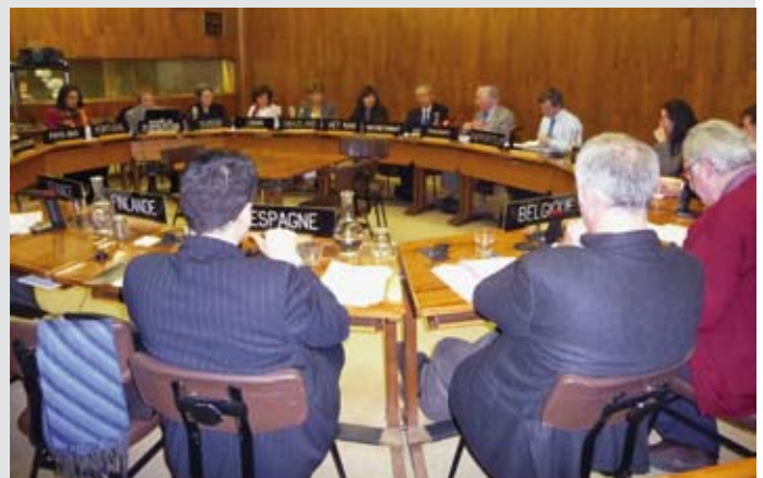
Meeting of National Commissions in Paris, 20 January 2009