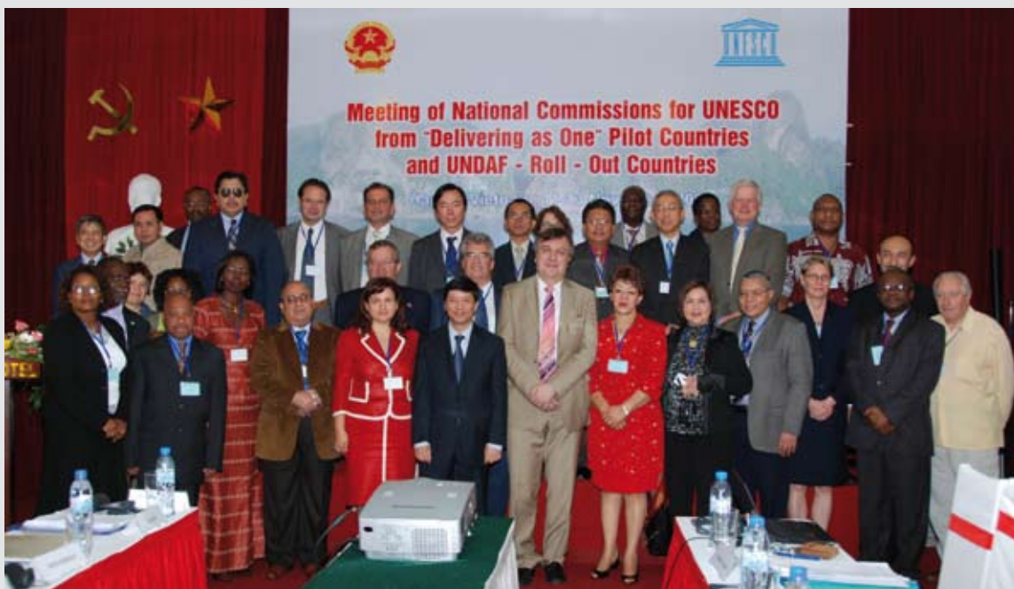
Meeting of National Commissions in Hanoi