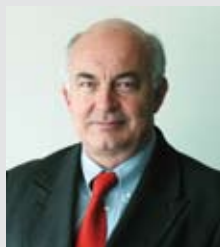
Mr Kemal Dervis Administrator, UNDP

In view of the on-going "One UN" reform at country level and UNESCO's engagement in this process, the positioning of National Commissions becomes a key question to be addressed. Effort has been made in recent months by the Organization and National Commissions to explore the possible role and capacities of the latter in order to allow them to effectively contribute to the common country programming processes.