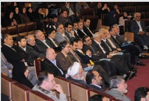
Celebration of the 60 th anniversary of Iran's membership to UNESCO

Over the past six decades, the Islamic Republic of Iran and its National Commission for UNESCO have actively participated in and contributed to the development of UNESCO programmes in all fields of competence of the Organization. To commemorate the dual anniversary, a national congress was organized on 23 December 2008 by the Iranian National Commission in cooperation with the UNESCO Tehran Cluster Office. Among the 300 participants were line ministries' representatives, school teachers, education planners, scientists, artists, heritage site managers, journalists and ICT specialists. Representatives of UNICEF, UNDP and other UN agencies present in Tehran also attended the Congress.