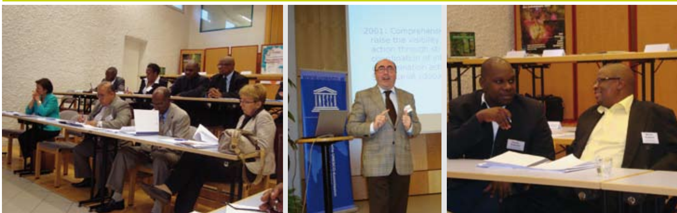
Participants of the Vienna Seminar