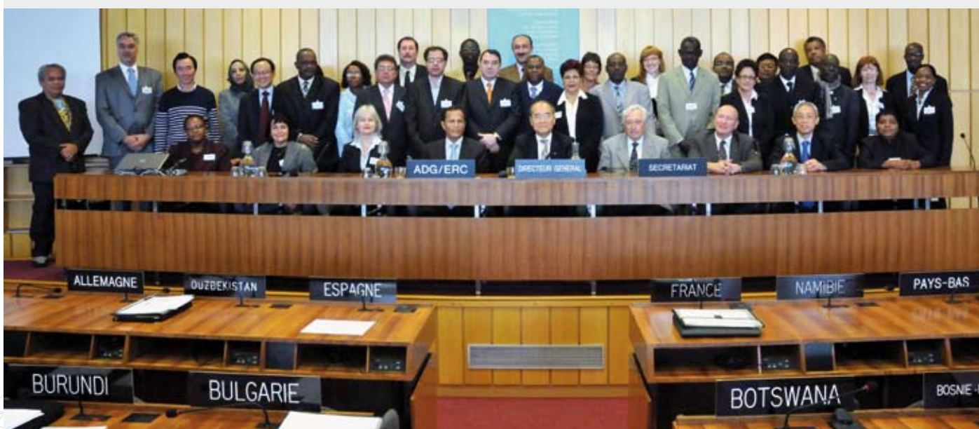
Participants of the 2009 Interregional Information Seminar